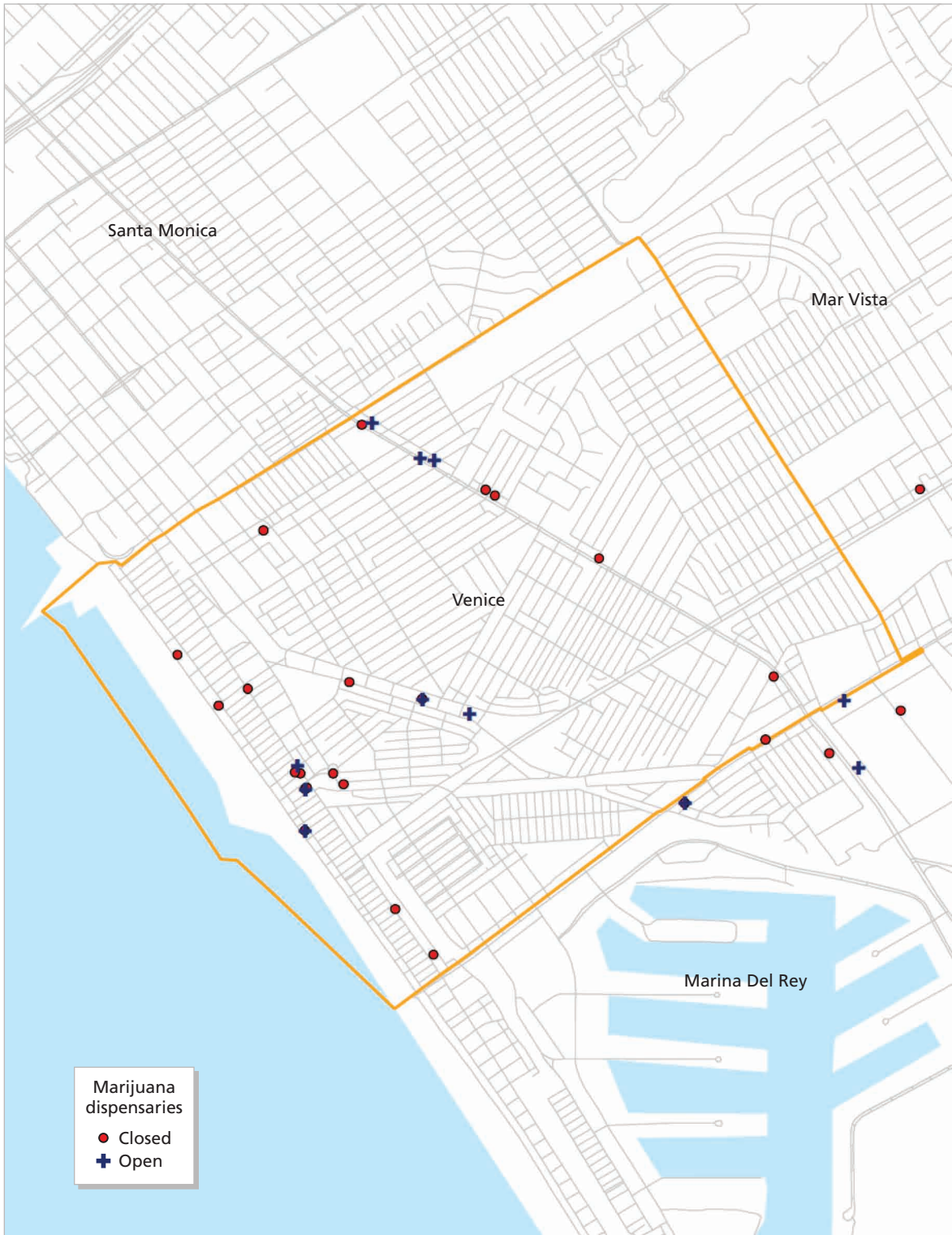
Figure 2 Geographic Distribution of Medical Marijuana Dispensaries in Venice, California, as of June 7, 2010